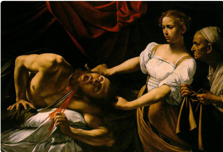
#3 | Judith Beheading Holofernes | 1598 | oil on canvas 130 x 160 cm | Palazzo Barberini: Rome, Italy