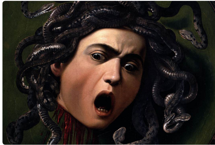
#2 | The Head of Medusa | 1598 | oil on canvas 60 x 55 cm | Uffizi: Florence, Italy