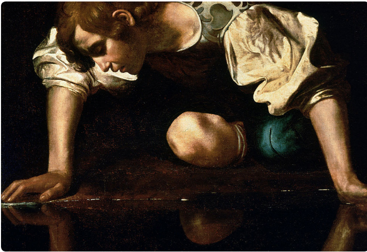
#1 | Narcissus | 1595 | oil on canvas 110 x 92 cm | Palazzo Barberini: Rome, Italy