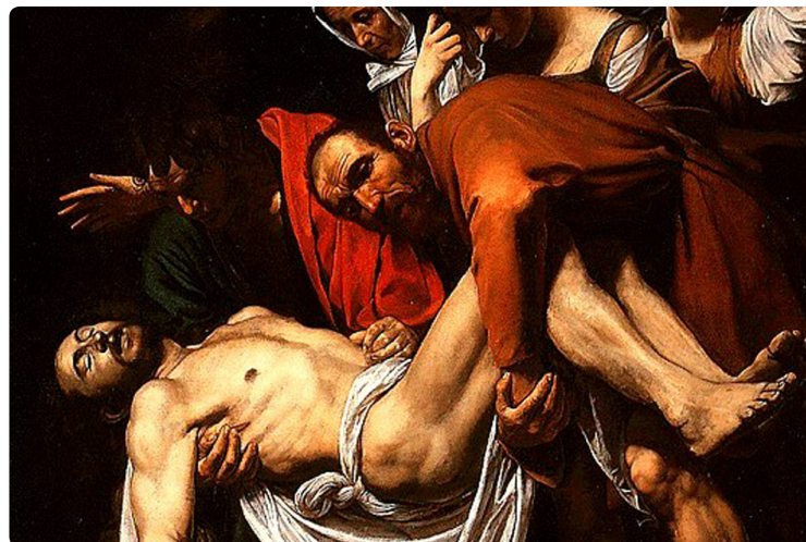
#6 | The Entombment | 1602-04 | oil on canvas 300 x 203 cm | Pinacoteca Vaticana: Vatican City, Italy