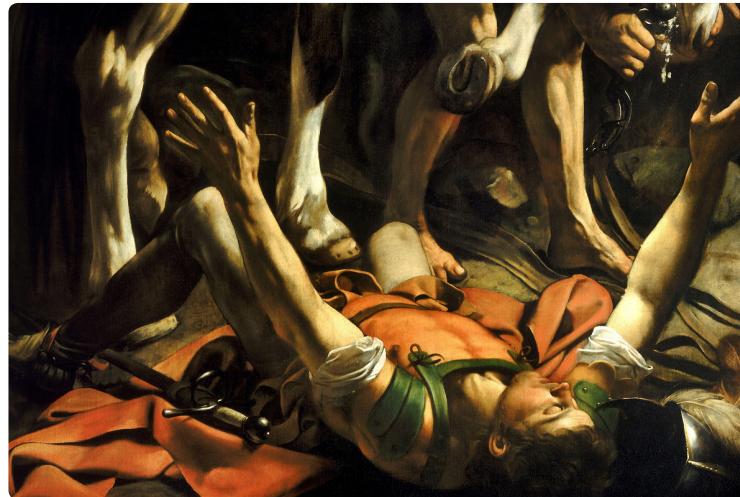
#4 | The Conversion on the Way to Damascus | 1601 | oil on canvas 230 x 175 cm | Cerasi Chapel, Santa Maria del Popolo: Rome, Italy