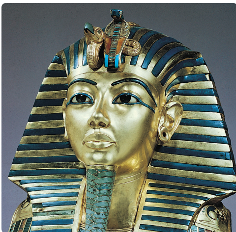
#7 | Mask of Tutankhamun (from his tomb in Thebes, Egypt) 1323 BC | gold with semiprecious stones | 53 cm high Egyptian Museum: Cairo, Egypt