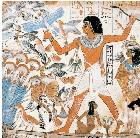
#5 | Fowling Scene (from Nebamon's tomb in Thebes, Egypt) 1350 BC | fresco | 98 x 115 cm British Museum: London, United Kingdom