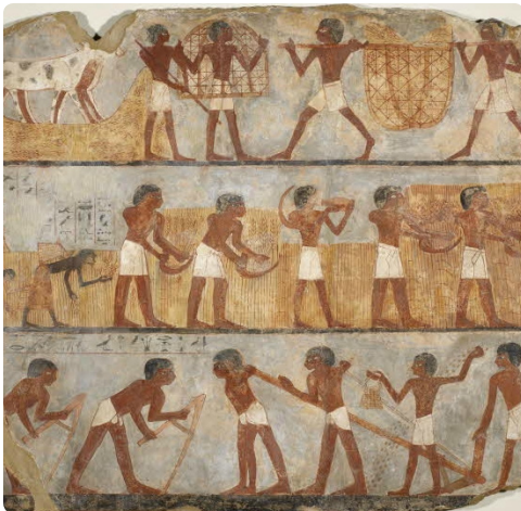
#4 | Harvesting Scene (from Unsu's tomb in Thebes, Egypt) 1479–1475 BC | paint and pigment on plaster | 68 x 94 cm Louvre: Paris France