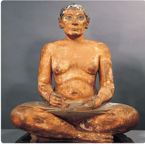
#1 | The Seated Scribe (from Saqqara, Egypt) 2620–2500 BC | limestone, paint | 54 cm high Louvre: Paris France