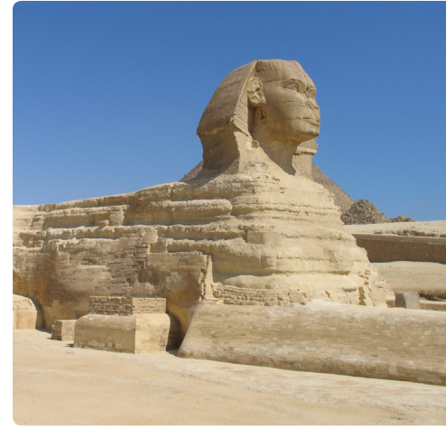
#3 | Great Sphinx 2520–2494 BC | sandstone | 73 m long, 20 m high Giza, Egypt