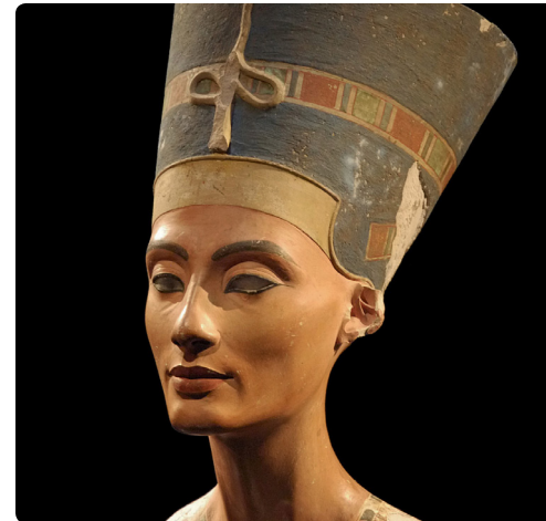
#6 | Bust of Queen Nefertiti (from Amarna, Egypt) 1340 BC | limestone, gypsum, crystal and wax | 50 cm high Egyptian Museum: Berlin, Germany