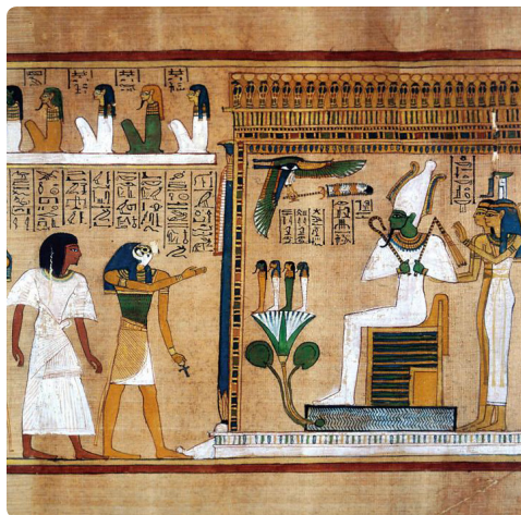
#8 | Book of the Dead of Hunefer (from his tomb in Thebes) 1275 BC | painted papyrus scroll | 39 cm high British Museum: London, United Kingdom