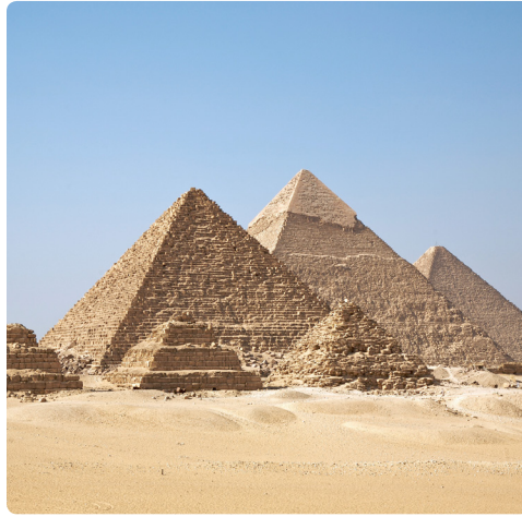
#2 | Great Pyramids (Mankaure, Khafre, Khufu) 2551–2472 BC | limestone | Khufu: 73 m base, 137 m high Giza, Egypt