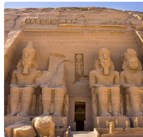
#9 | Temple of Ramses II 1290–1224 BC | sandstone | colossi: 20 m high Abu Simbel, Egypt