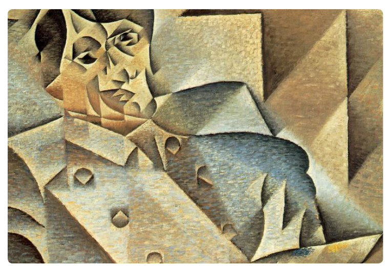
#1 | Portrait of Picasso | 1912 | oil on canvas 93 × 74 cm | Art Institute Chicago: Chicago, IL