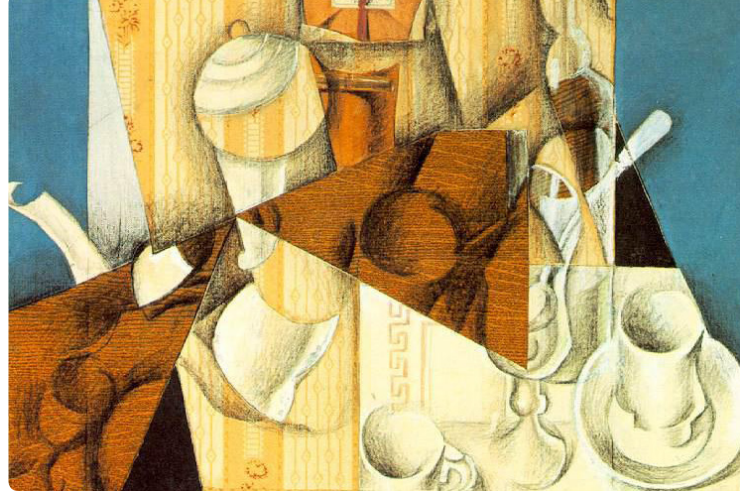
#4 | Breakfast | 1914 | gouache, oil, crayon, and paper on canvas 81 \times 60 cm | Museum of Modern Art: New York, NY