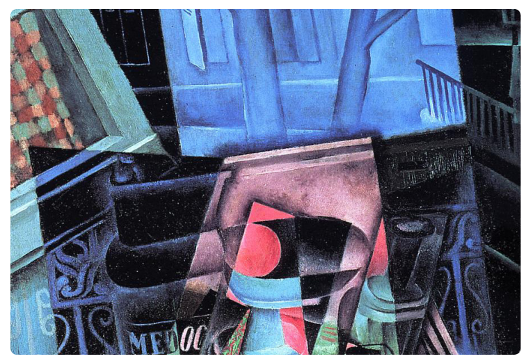
#5 | Still Life before an Open Window, Place Ravignan | 1915 | oil on canvas 116 \times 89 cm | Philadelphia Museum of Art: Philadelphia, PA