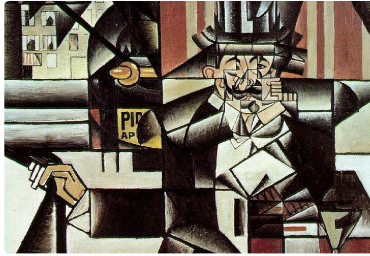
#2 | Man in a Café | 1912 | oil on canvas 128 \times 88 cm | Philadelphia Museum of Art: Philadelphia, PA