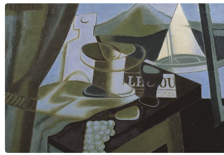
#6 | Overlooking the Bay | 1921 | oil on canvas 63 x 96 cm | Tate Collection: London, United Kingdom