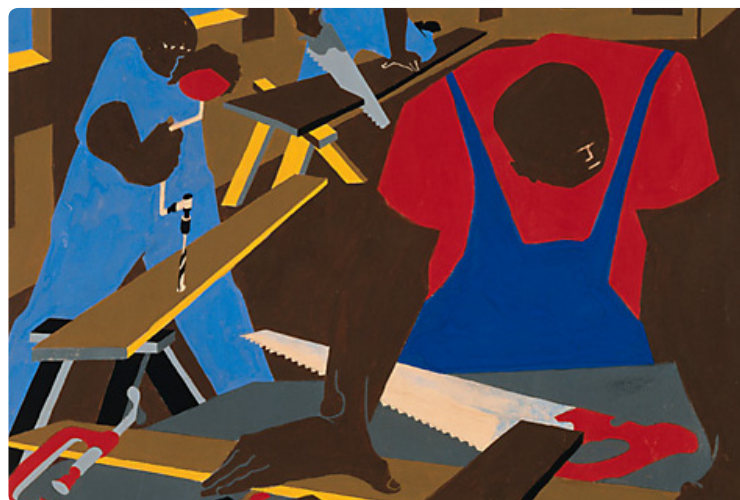
#6 | Carpenters | 1977 | gouache on paper 48 x 58 cm | Private Collection