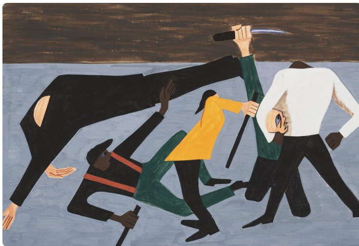
#1 | The Migration of the Negro (Panel 52) | 1940-41 | casein tempera on hardboard 30 x 46 cm | The Museum of Modern Art: New York, NY