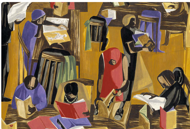
#5 | The Library | 1960 | tempera on fiberboard 61 x 76 cm | Smithsonian American Art Museum: Washington, DC