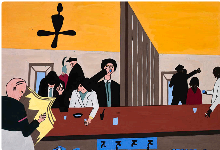
#3 | Bar and Grill | 1941 | gouache on paper 42 x 58 | Smithsonian American Art Museum: Washington, DC