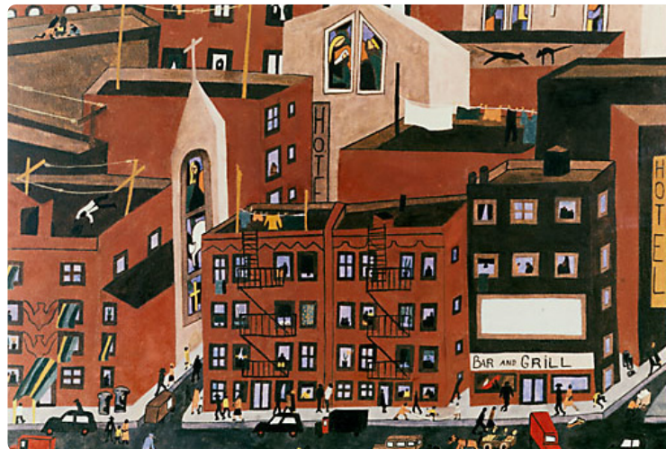
#4 | Harlem | 1942 | gouache on composition board 55 x 76 cm | Private Collection