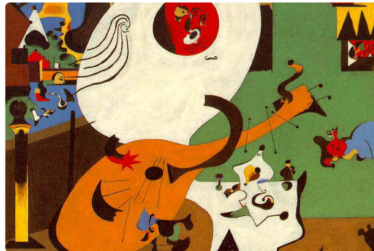
#4 | Dutch Interior I | 1928 | oil on canvas 92 x 73 cm | The Museum of Modern Art: New York, NY