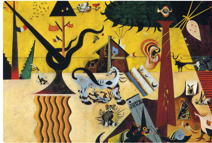
#2 | The Tilled Field | 1924 | oil on canvas 66 x 93 cm | Guggenheim Museum: New York, NY