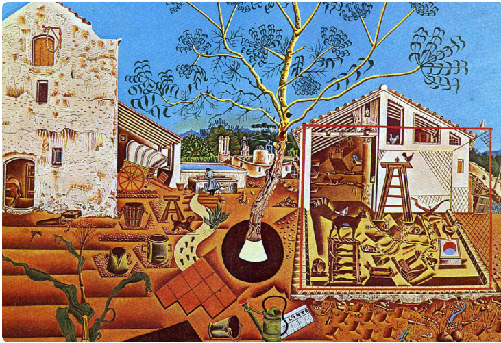
#1 | The Farm | 1922 | oil on canvas 124 x 141 cm | National Gallery of Art: Washington, DC