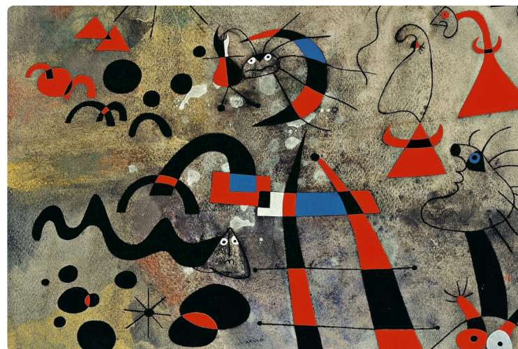
#6 | The Escape Ladder | 1940 | gouache, watercolor, and ink on paper 40 x 48 cm | The Museum of Modern Art: New York, NY