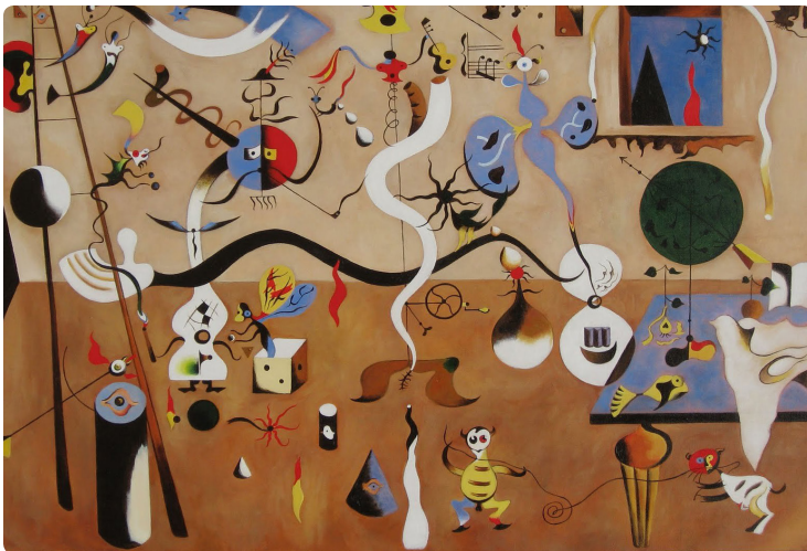
#3 | Harlequin's Carnival | 1925 | oil on canvas 66 x 90 cm | Albright-Knox Art Gallery: Buffalo, NY