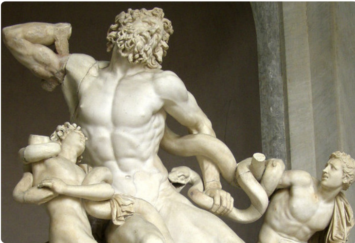
#3 | Athanadoros, Hagesandros, and Polydoros | Laocoön and His Sons | 25 BC | marble 208 cm high | Vatican Museums: Vatican City, Rome