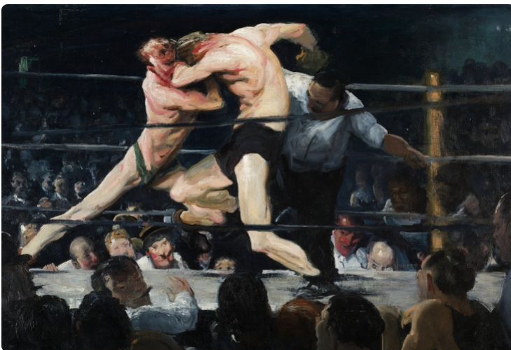
#5 | George Bellows | Stag at Sharkey's | 1909 | oil on canvas 92 x 123 cm | The Cleveland Museum of Art: Cleveland, OH