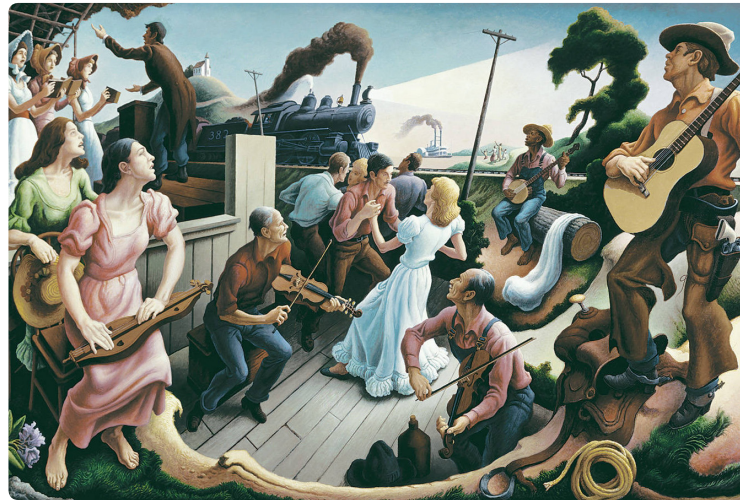
#4 | Thomas Hart Benton | The Sources of Country Music | 1975 | acrylic on canvas 183 x 305 cm | Country Music Hall of Fame and Museum: Nashville, TN