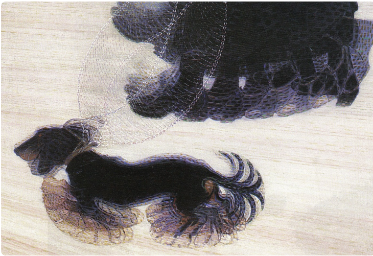
#1 | Giacomo Balla | Dynamism of a Dog on a Leash | 1912 | oil on canvas 91 x 110 cm | Albright-Knox Art Gallery: Buffalo, NY