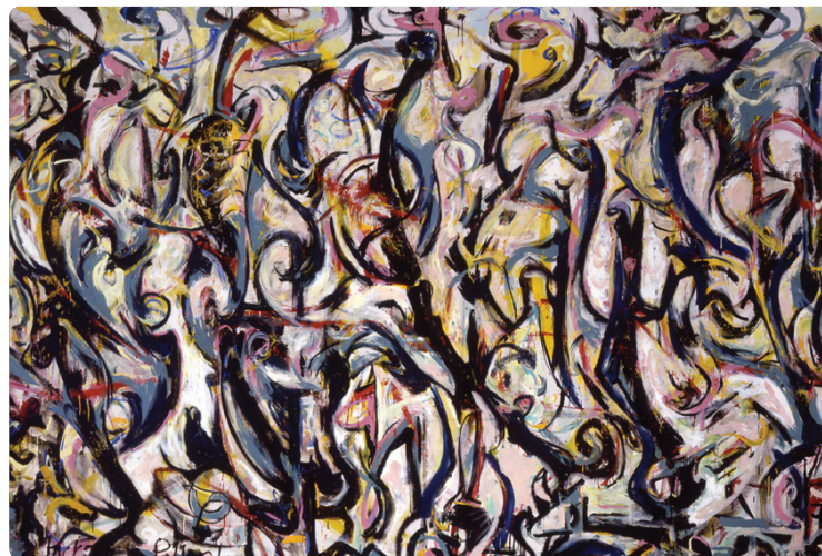
#6 | Jackson Pollock | Mural | 1943 | oil on canvas 247 x 605 cm | University of Iowa Museum of Art: Iowa City, IA