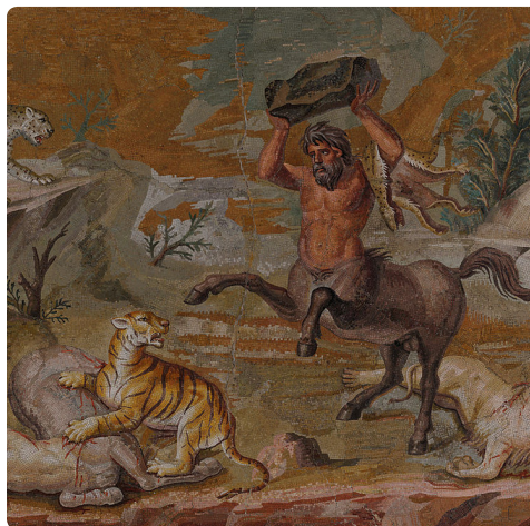
#8 | Centaurs Fighting Cats of Prey (from Hadrian's Villa) 130 | mosaic | 58 x 91 cm Altes Museum: Berlin, Germany