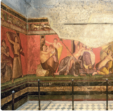
#1 | Dionysiac Mystery Frieze 60-50 bc | fresco | 162 cm high Villa of Mysteries: Pompeii, Italy