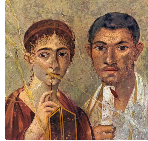
#3 | Portrait of Husband and Wife 70-79 | fresco | 88 x 51 cm Pompeii, Italy