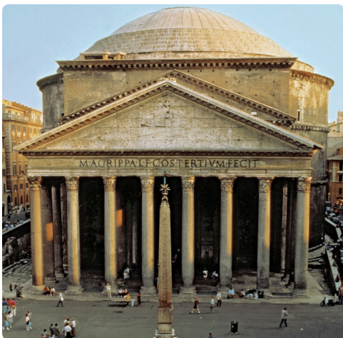
#7 | Pantheon 118-125 | granite and concrete | 43 m high Rome, Italy