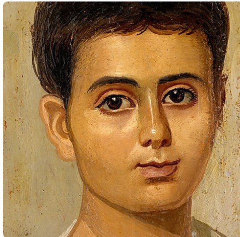
#5 | Portrait of the Boy Eutyches (Faiyum mummy portrait) 100-150 | encaustic on wood, paint | 38 x 19 cm The Metropolitan Museum of Art: New York, NY