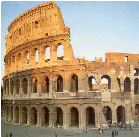
#4 | Colosseum 70-82 | concrete and stone | 48 m high Rome, Italy