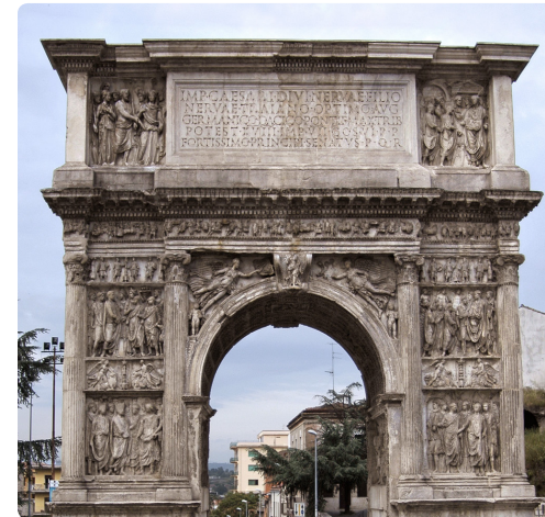
#6 | Arch of Trajan 114-118 | limestone and marble | 15.5 m high Benevento, Italy