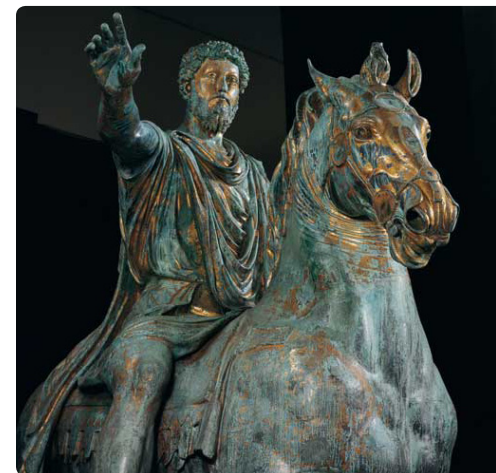
#9 | Equestrian Statue of Marcus Aurelius (from Rome, Italy) 175 | bronze | 350 cm high Musei Capitolini: Rome, Italy