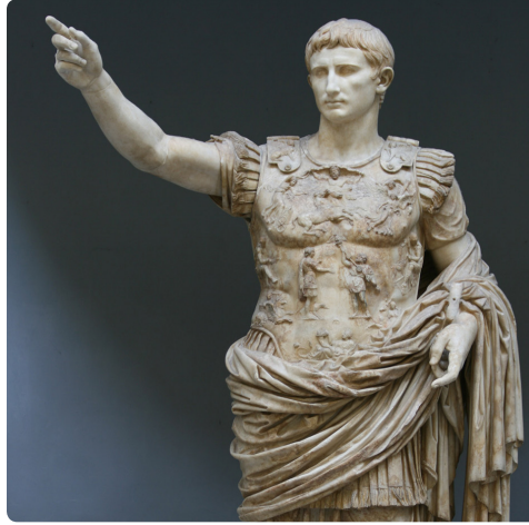
#2 | Portrait of Augustus as General 20 bc | marble | 203 cm high Vatican Museums: Rome, Italy