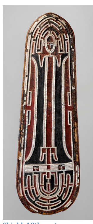
Shield, 19th century, Solomon Islands, Met Museum