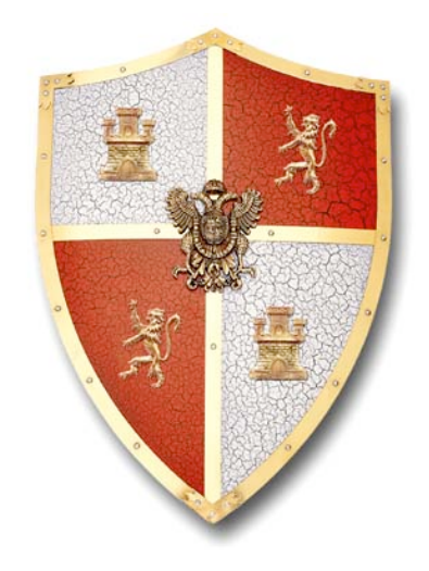
Replica of Medieval Shield

Though shields are primarily designed for physical protection, many are decorated with emblems or symbols for spiritual protection or to represent one's self or family.