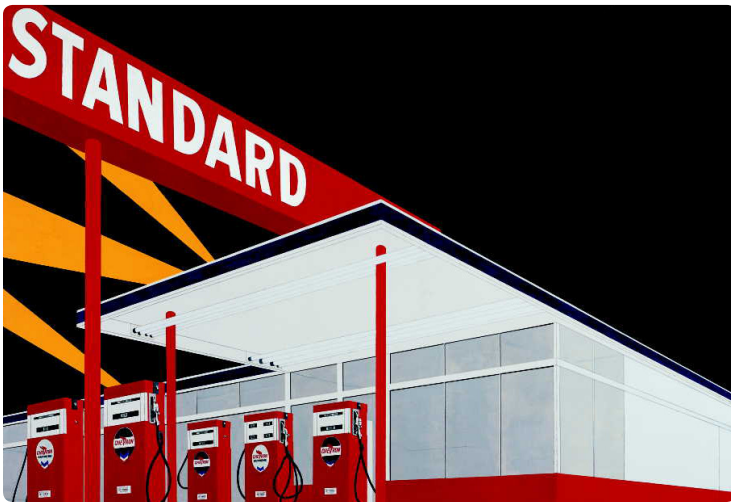
#3 | Ed Ruscha | Standard Station, Amarillo, Texas | 1963 | oil on canvas 164 x 309 cm | Hood Museum of Art: Hanover, NH