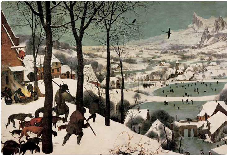
#1 | Pieter Bruegel the Elder | The Hunters in the Snow | 1565 | oil on panel 117 x 162 cm | Kunsthistorisches Museum: Vienna, Austria