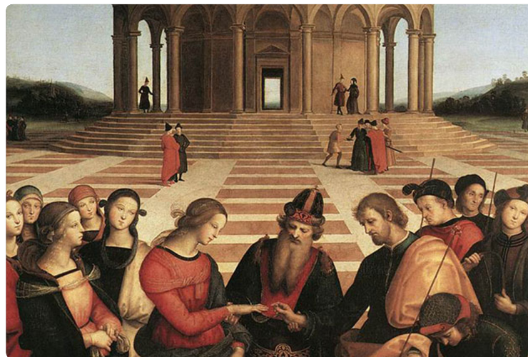
#6 | Raphael Sanzio | The Marriage of the Virgin | 1504 | oil on panel 174 x 121 cm | Pinacoteca di Brera: Milan, Italy