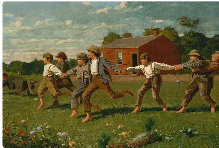
#4 | Winslow Homer | Snap the Whip | 1872 | oil on canvas 30 x 51 cm | The Metropolitan Museum of Art: New York, NY