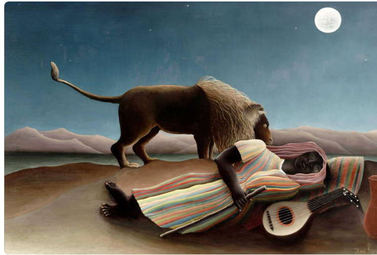
#2 | Henri Rousseau | The Sleeping Gypsy | 1897 | oil on canvas 129 x 201 cm | Museum of Modern Art: New York, NY