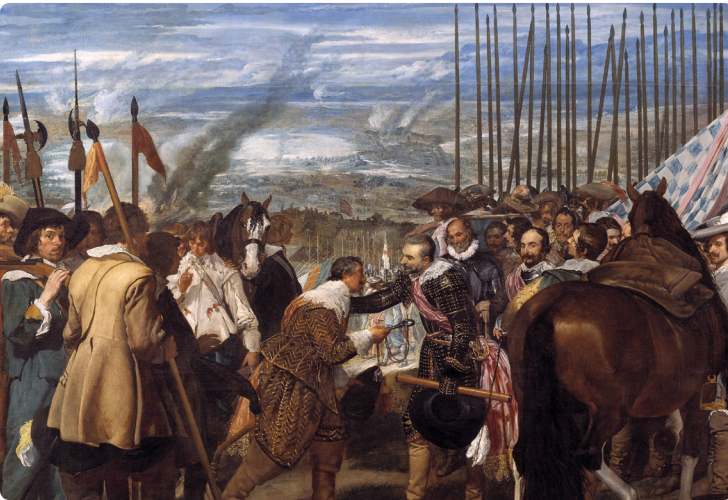
#3 | The Surrender of Breda | 1634-35 | oil on canvas 307 x 367 cm | Museo del Prado: Madrid, Spain