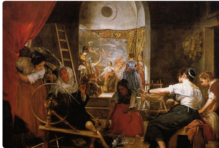
#4 | The Thread Spinners | 1644 | oil on canvas 220 x 289 cm | Museo del Prado: Madrid, Spain