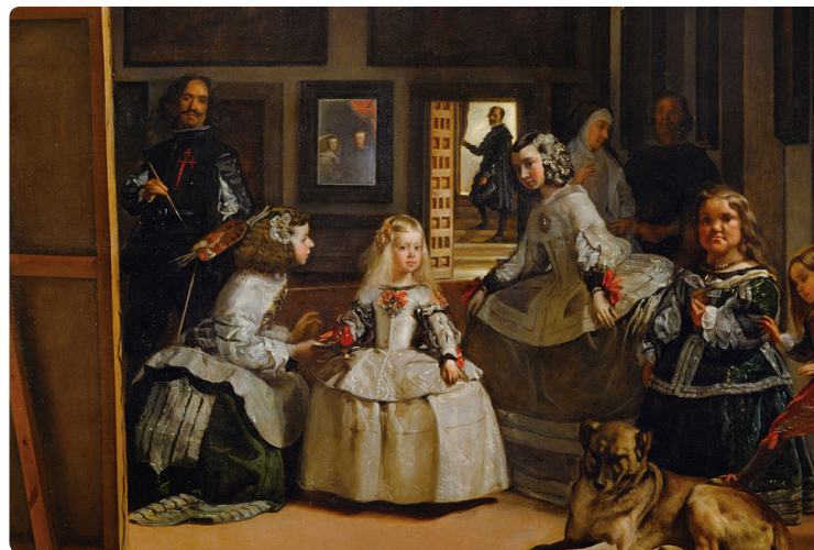
#6 | Las Meninas | 1656 | oil on canvas 320 x 276 cm | Museo del Prado: Madrid, Spain