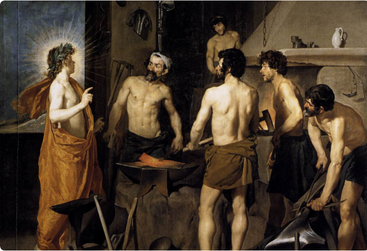
#1 | The Forge of Vulcan | 1630 | oil on canvas 223 x 290 cm | Museo del Prado: Madrid, Spain