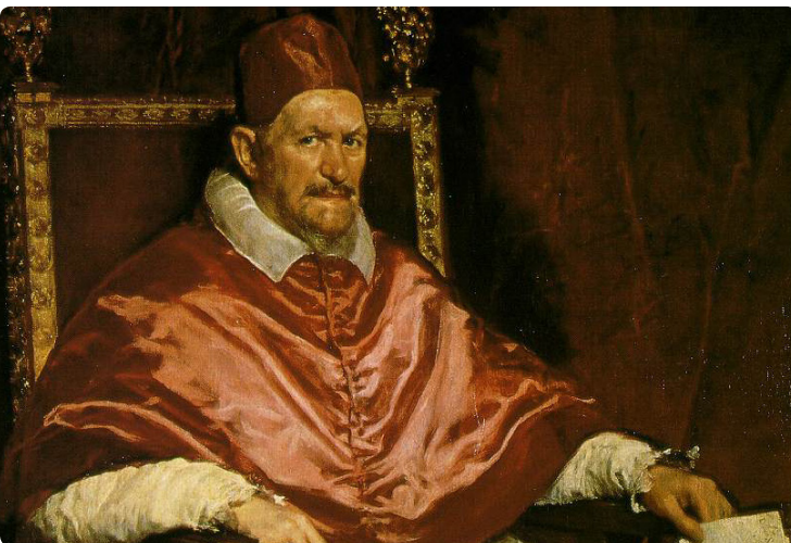
#5 | Portrait of Pope Innocent X | 1650 | oil on canvas 141 x 119 cm | Galleria Doria-Pamphilj: Vatican City, Italy