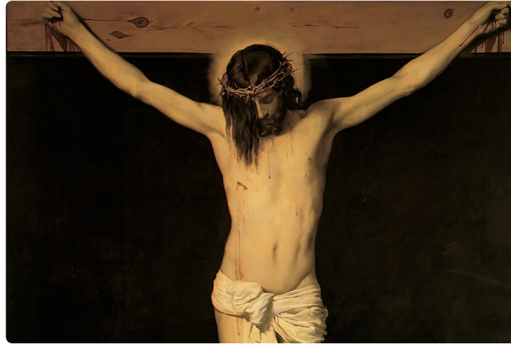
#2 | Christ on the Cross | 1632 | oil on canvas 250 x 170 cm | Museo del Prado: Madrid, Spain